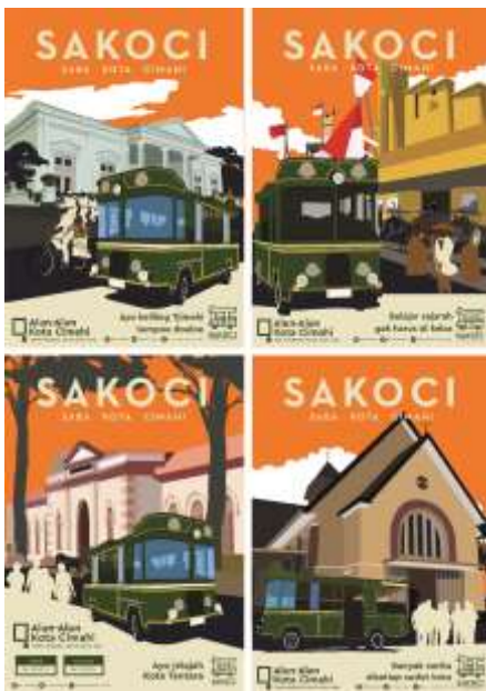
Figure 3. Poster Design

With the concept of educational tourism, the design of promotional media for the Cimahi City Cimahi Military Heritage Tour military history tourism program focuses on 3 key words namely tourism, military and history. Illustration that will be used for promotional media revolves into two aspects, namely history and military. By using historical photos in Cimahi City, it can be made into an illustration and icons for each other historical place. Then the visual elements are given an old-fashioned style such as art deco so that it reinforces the historic impression that wants to be highlighted in this program.