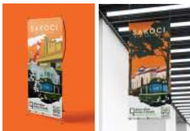
Figure 4. Banner Mockup