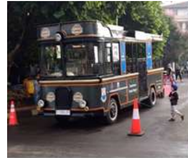
Figure 1. Bus SAKOCI at pickup point

people and a small number got information from promotional media.