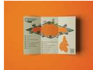
Figure 5. Tour Route Map

In addition to conventional media, social media is also a means to promote historical tour tours with SAKOCI buses. Frame #NaikSAKOCI harmonizes photos of tourists' historical tours. besides that, #NaikSAKOCI gives space for tourists to share their experiences, the hashtag also makes it easier for other tourist to find information about historical tours.