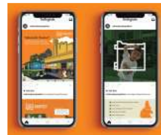
Figure 7. Social Media Mockup