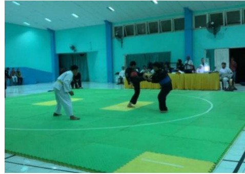
In frame: Reihan Ditama (red corner) O2SN SMA 2023, Provincial Level.