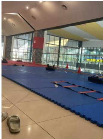
Training session in preparation for IPSI CUP V 2023