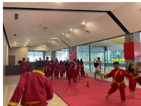
Tapak Suci Sports Academy weekly training session.