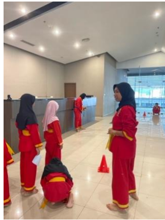
Tapak Suci Sports Academy weekly training session.