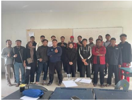
Technical Meeting for O2SN SMA 2023 City Level. (Researcher in the middle with black hijab)