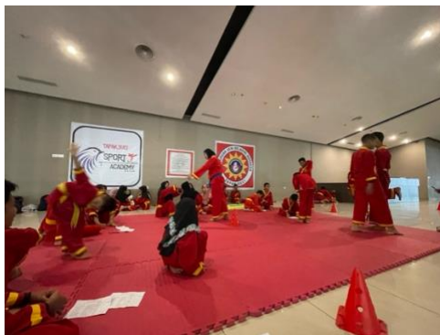
Tapak Suci Sports Academy weekly training session.