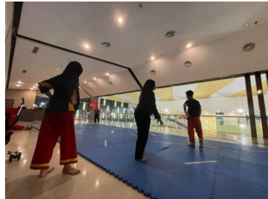
Training session in preparation for IPSI CUP V 2023