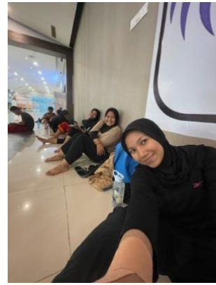
In frame: Researcher with TSSA athletes during training session in preparation for IPSI CUP V