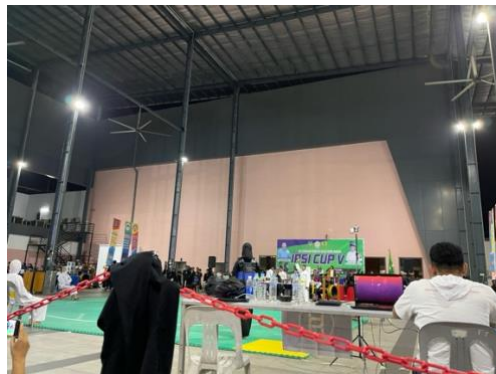
Match day IPSI CUP V 2023