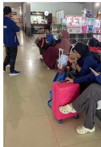
In frame: Team Batam athletes Departure day for O2SN SMA 2023, Provincial Level.