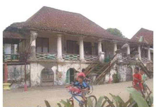
Figure 5. Settlement of Kampung Kapitan.