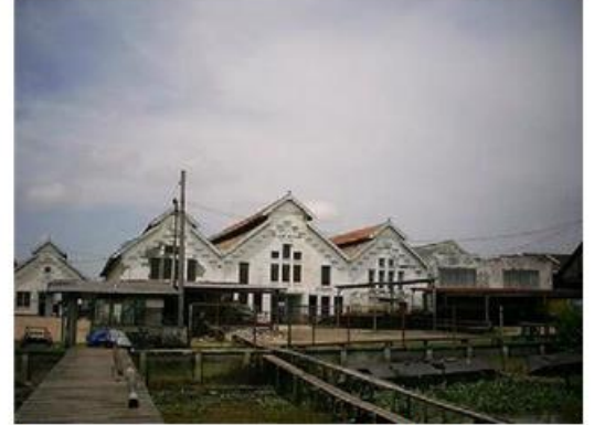
Figure 4. Kampung Assegaf 16 Ulu Palembang Settlem ents.