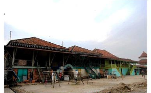
Figure 3. Kampung Arab 10 Ulu Palembang Settlements.