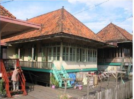
Figure 6. Panggung house at Ulu Palembang area.

The form of the house with a stage that is not so high and there are no territorial boundaries between other buildings, so between one building to another building opposite the pedestrian road leading to the settlement around.