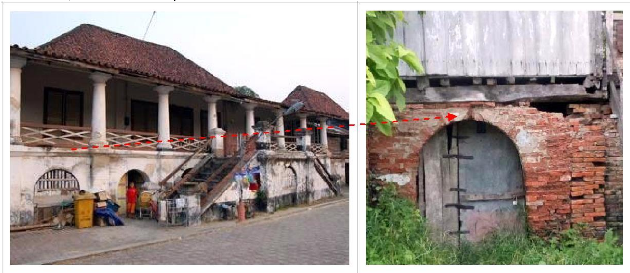
Figure 10. Tiled Brick Techniques Applied to Home Stage at Kampung Kapitan 7 Ulu Palembang.

From the location of the observation the authors found a variety of local building materials used in residential population of Kampung Ulu , such as wood unglen (Ulin), softwood, meranti wood, to bamboo, and the roof of palm leaves.