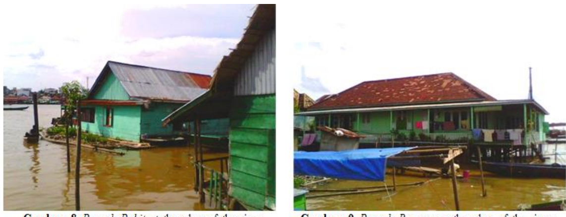
Gambar 8. Rum ah Rakit at the edge of the river<br/>Musi Ulu Palembang.Gambar 9. Rum ah Panggung the edge of the river<br/>Musi Ulu Palembang.

At swamp land they still make the construction stage to overcome the tidal conditions, elongated building that is used for the six heads of families, they use a laundry area and bathrooms are communal. In general, residents who choose the location of the river to form a residential home.