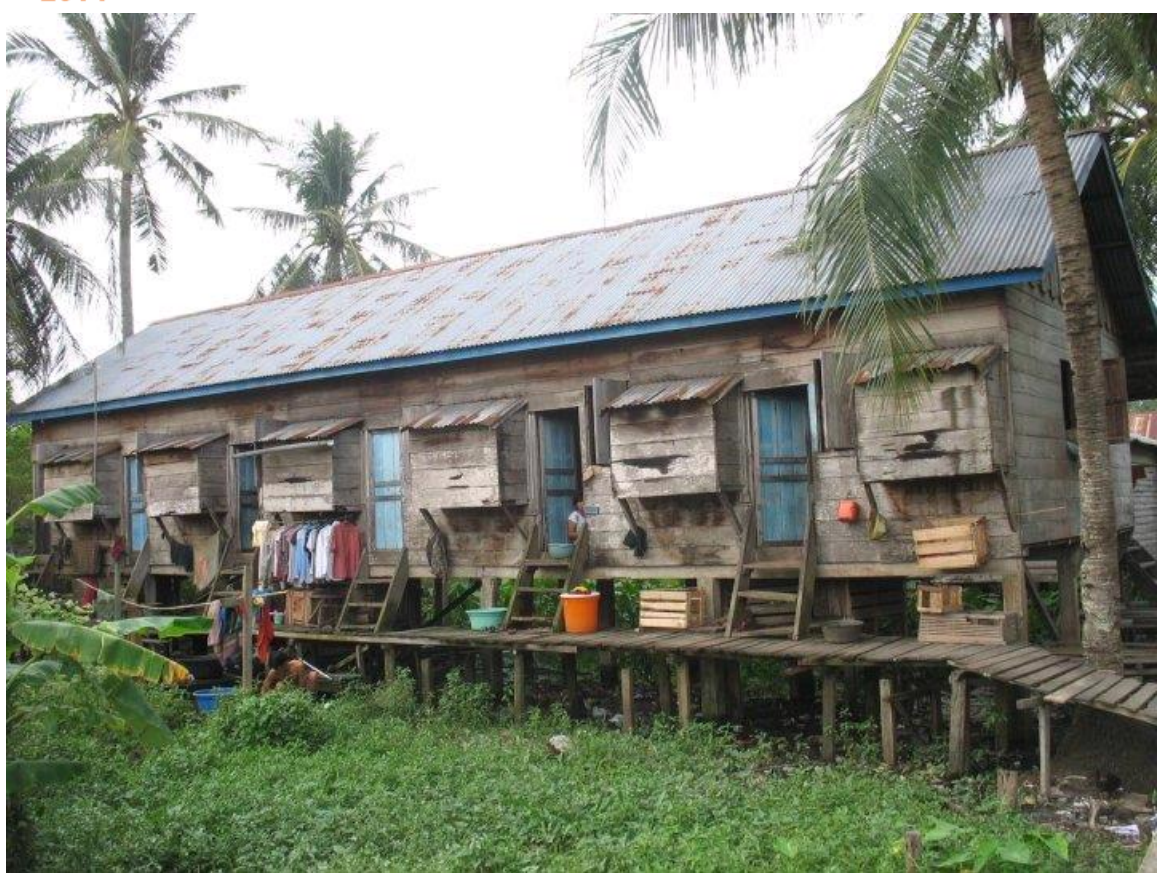
Figure7. Rumah Bedeng at Ulu Palembang Area.

At swamp land they still make the construction stage to overcome the tidal conditions, elongated building that is used for the six heads of families, they use a laundry area and bathrooms are communal. In general, residents who choose the location of the river to form a residential home.