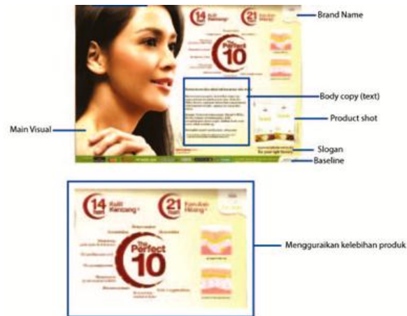
Figure 3. Layout Format Analysis

are made with the upright, and the picture large. This product is intended for consumers who live in the tropics and practical consumers, as seen from the form of ads that contained only the product, headlines and text, and not too much use of words, other than that this product can not only economic benefits but also provide benefits for skin health consumers because these products have to conduct clinical trials to determine their possible allergy products.