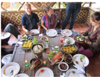
Fig.5. Lunch at a Sundanese Restaurant- cross-legged seating