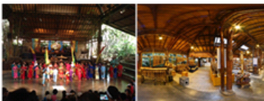
Fig.6. Saung Udjo Angklung Performance

The multiple sensory cues are tapped; lighting, furniture, interior furnishings, music, food and aroma, sound, which all contribute and complement each other as if a sensory orchestration. When the sensory experience is maximized, the restaurant atmosphere creates a compelling experience that consumers will want to repeat through repeated visits.