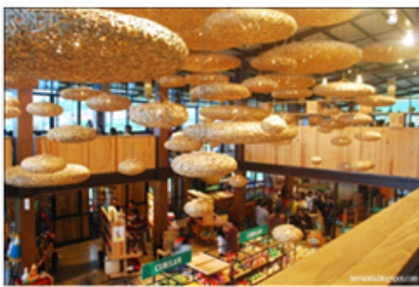
Fig.4. Dusun Bamboo Lobby Market