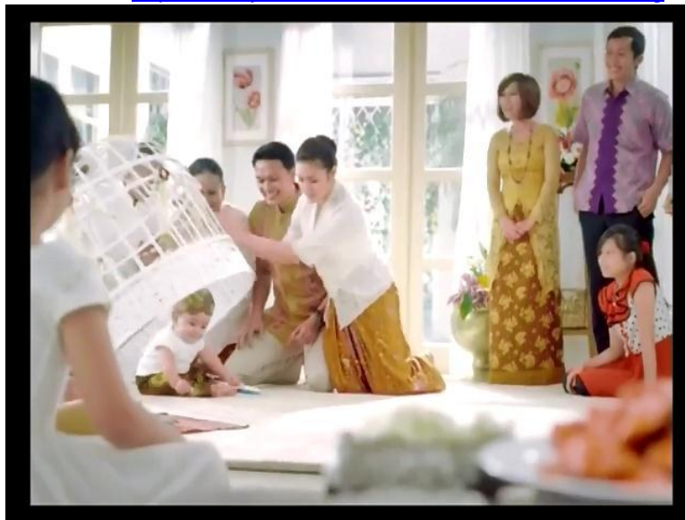
Figure 2. Iklan SUN