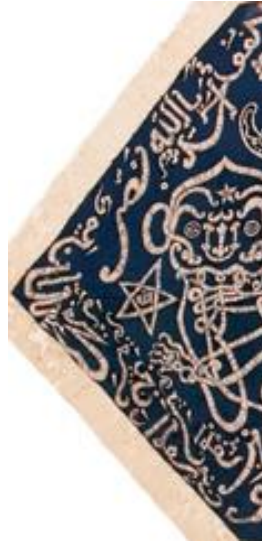
Pic. 4 Nasrun minallah wa fathun qorib, wabasiril mukminin type on Macan Ali's Flag