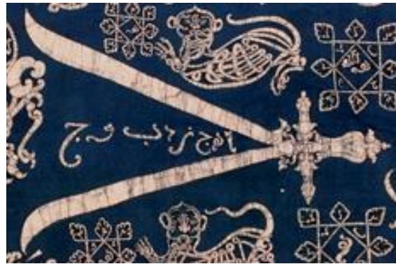
Pic. 1 Picture of Zulfikar sword in Macan Ali's Flag of Cirebon Sultanate

Zulfikar Sword, is the nickname for the double-edged sword is the symbol of jihad and also the courage of Ali ibn Abi Thalib. With this weapon, he struggles guarding the Prophet Mohammed to preach and defend the glory of Islam from attack by enemies who envy with what Rasulullah. Zulfikar sword, a gift from the Prophet Mohammed to the fourth Islamic Caliph Ali ibn Abi Thalib who is also the law.