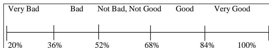
Continuum Line Measurement