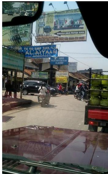
Figure 5: GoJek’s Warning at Ciganitri-Bandung

shy nor subtle people. They would immediately approach a ‘suspected’ GoJek driver in group and force him to leave instantly. They would also warn the customer for not using GoJek drivers anymore in ‘their’ area.