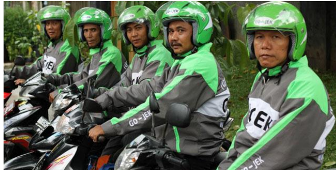
Figure 4: GoJek Drivers

The attributes that are shown above (Figure4), are the ones that GoJek drivers wear daily when they are on duty. Unfortunately, their identity which help customers into recognizing them on the streets, is more often a source of conflict between themselves and traditional ojek drivers. When a traditional ojek drivers sees a GoJek drivers in uniform, he will immediately asks the later to stay away from his territory aggressively. Such confrontation becomes more often and acute, as more customers witness the occurrence in front of their eyes. One example happened at the University of Indonesia where a customer asked a GoJek driver to pick him up on campus, but as the driver waited, he was approached by several ojek drivers which told him to leave by means of force. Consequently, the GoJek driver drove away and the customer had to use the local ojek with a highly-priced fare (tribunnews.com)