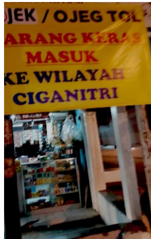
Figure 2: GoJek/Ojeg Tol Dilarang Keras Masuk ke Wilayah Ciganitri