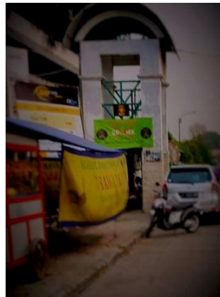
Figure 3: No GoJek

Consequently, it is no wonder that in many areas GoJek drivers are banned to enter and/or are not welcomed. It is also not surprising that there are physical clashes between ojek and GoJek drivers. As a result, fallen-victims (usually from GoJek's side) become a common incident. In order to 'save' themselves, GoJek drivers in Bandung do not wear their uniforms or attributes. Thus, they can safely pick up customers and/or transport delivery without any obstacles.