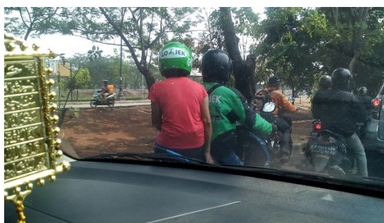
Figure 6: GoJek driver and customer in Jakarta

As a consequence, GoJek drivers in Ciganitri-Bandung do not wear their uniforms (jackets) or helmet in fear of their safety. They also try to be ‘invisible’ or ‘hidden’ so they select and pick up customers carefully and quickly. Their identity are so concealed that it is almost impossible to differentiate between GoJek drivers or students or ordinary people. That situation differs significantly from the one in Jakarta, where GoJek drivers can be seen and recognized at almost every corner of the streets.