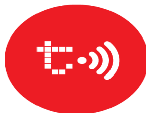
Figure 1.2 T-Cash Logo

Telkomsel has an electronic money service named T-Cash that launched in January 9 th , 2007. Telkomsel is one out of five telecommunication companies in Indonesia that operate e-money transaction. Telkomsel got licensed from Bank Indonesia at July 3 rd 2009. T-Cash can be used by all Telkomsel subscribers. Unlike phone credit, T-Cash enables the users to store the money and use it to any transaction.