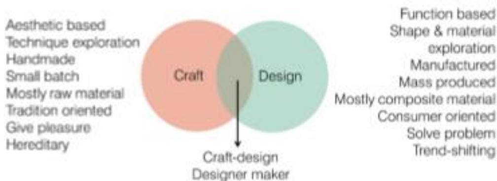
Figure 2. Characteristics of Craft and Design

Craft-design combines characteristics of both craft and design in a single product. For example a craft-design product may be produced by hand in limited edition (craft characteristics) but use composite material and functional (design characteristics). To some extent the highest distinction is that craft or craft-art represents hereditary cultural tradition while craft-design adapts the newest trend.