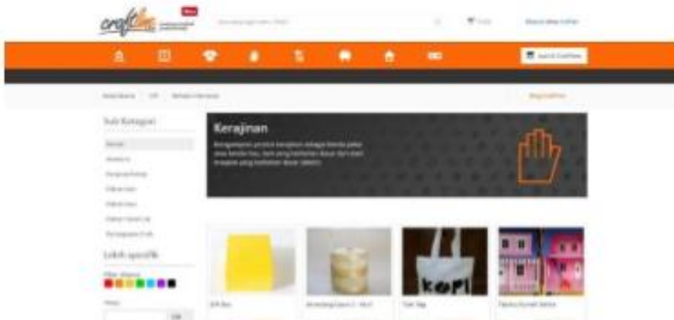
Figure 5. Craftline website

Craft-design marketplace can be divided into online and offline. Etsy is the biggest online craft marketplace around the world with 36 million active buyers and sellers (Benedict Dellot, 2014). Many of Etsy sellers earn their living cost only by selling in Etsy.