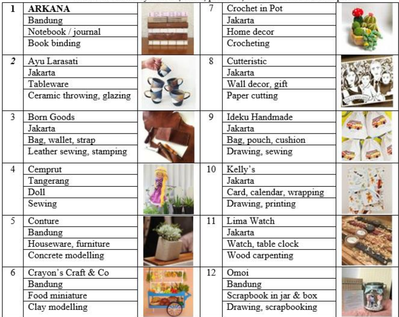
Table 1. List of brands by makers, cities, products, and materials or techniques

Because of its authenticity, craft-design products are easy to differentiate from mass-produced products. They are produced in small-batches or limited editions, which enhance exclusivity. Most of the makers uses pre order or made by order system. It is also advantageous to the customer because they can order custom made products based on their taste and need. As an example, if you want to order a memory jar at Omoi as a gift, Andintya Anissa, the owner of Omoi, will request photos and details such as your beloved ones favourites and profile to create a personalized memory jar. Indeed the result is a very personal present.