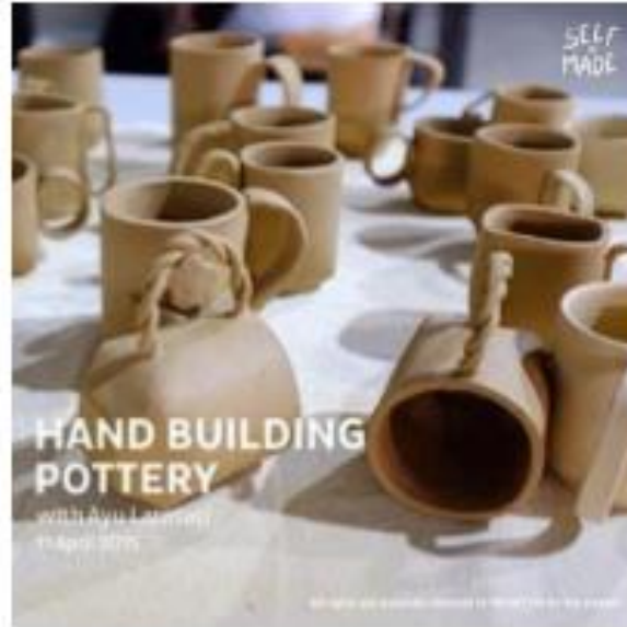
Figure 4. Hand building pottery workshop by Ayu Larasati at Indoestri Makerspace

Skill-sharing is another engagement for the Makers' brands. Some makers obtain additional income from workshop teaching or open studio. The cost may vary and depends on the organizer, some may be free, but it is mostly a simple, event-based, or a lecture only (without practice) workshop. To illustrate Ayu Larasati hosts a hand building pottery workshop which costs Rp. 1 million at Indoestri Makerspace but she also has a short lecture class with Lingkar.co which is free. After all it is a way for them to connect with other makers and craft enthusiasts. Other prominent workshop organizers are Living Loving Class, Mau Belajar Apa, and Tobucil.