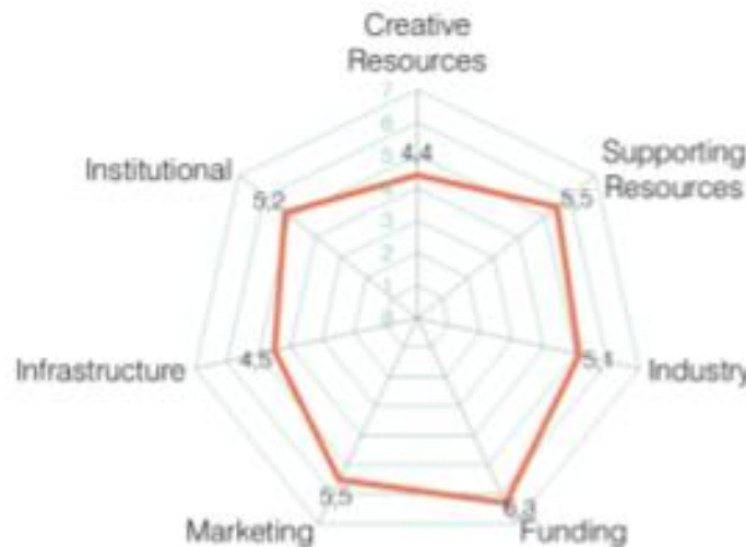
Figure 3. Mapping of competitiveness for Indonesian craft

Cokorda Istri Dewi (2014) from Ministry of Tourism and Creative Economy stated that the main problem of Indonesia’s craft industry is the lack of creative resources (creative people involved in this industry). It has the smallest figure (scale 1 to 10) among other seven indicators. Empowering craft-design makers is one way to reinforce this indicator.