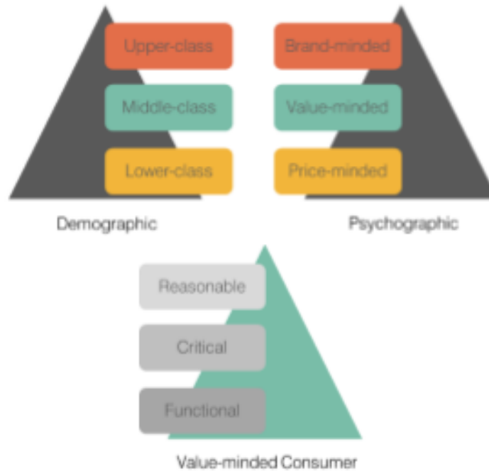
Figure 6. Consumer 3000 Segmentation

The connection with craft-design development can be considered as such: At first consumer wants to create (DIY movement), then shifts into buying local brand (local value awareness), and later on became more specific on choosing valuable local handmade products (craftsmanship value awareness).