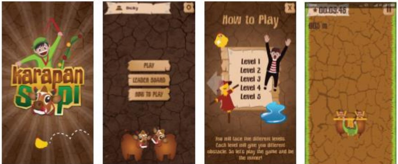
Figure 3. Screenshots of The Game Android Karapan Sapi