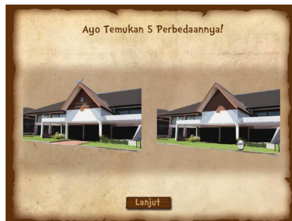
Figure 5.3 Mini-quest of Game Mari Mengenal Bandung

The challenge in this game is given in the mini-quest where players should be able to compete the mini-quest to acquire the information and knowledge about educational attractions.