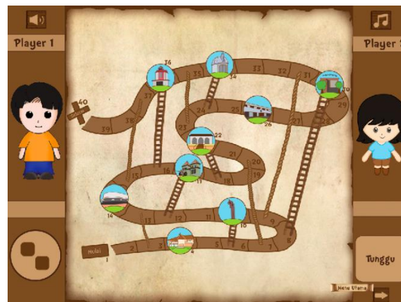
Figure 5.2 Boardgame and Headsup Display of Game Mari Mengenal Bandung

This educational game provide information and knowledge about educational attraction in Bandung, such as: