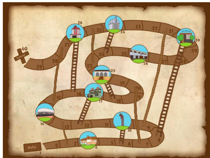
Figure 5.7 Board game Interface of Game Mari Mengenal Bandung

Players will feel like playing an adventure because the display of snake and ladder's path is like lane road on a treasure map