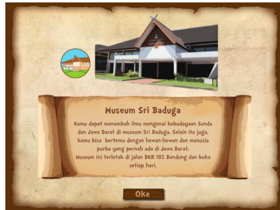
Figure 5.4 Information Display of Game Mari Mengenal Bandung