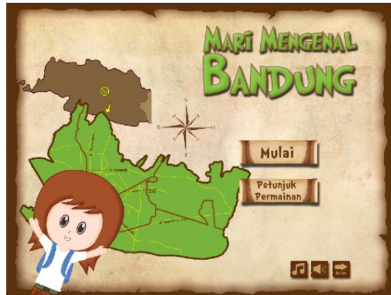
Figure 5.1 Main Menu of Game Mari Mengenal Bandung