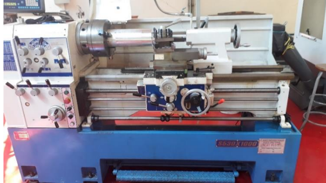
Figure I.2 S530 X 1000 Lathe in Manufacturing Building at Telkom University

In Figure I.2, it is shown a manual turning lathe in the Telkom University manufacturing building