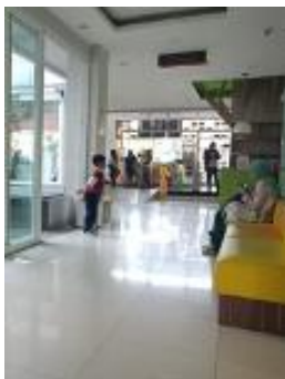
Figure 7. Waiting Room of Child's area

especially in health facilities that combines natural, physical and psychological aspects with the aim of providing positive benefits in the process of patient adaptation. A good adaptation process will have an impact on reducing the level of stress the patient can help the recovery process. To achieve the desired benefits with a healing environment approach, there are a number of things that need attention, including; circulation, lighting, use of color in space and natural elements. This research was conducted at the Women and Child's Hospital of Grha Bunda Bandung with the following results: