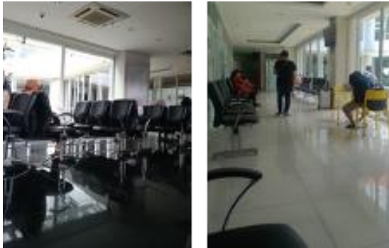
Figure 5 & 6. Waiting Room of Administration and Outpatient Installation figure 8 & 9: windows in the waiting room and corridor

Based on a literature review, the concept of healing environment can be interpreted as a concept of forming the environment,