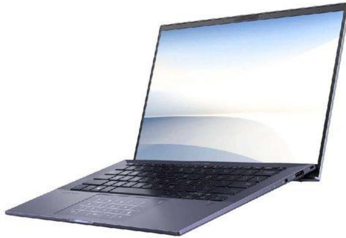
Figure 1.1 Image of Laptop

According to KBBI, a laptop is a compact, portable personal computer that fits on the user's lap. It is made up of a single unit that has a keypad, display screen, microprocessor, and is typically furnished with a rechargeable battery.