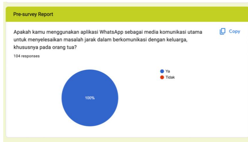
Figure 1. 2 Pre-Survey Report "a Descriptive Long Distance Family Communication by WhatsApp at PPM RJ Bandung"

PPM RJ Bandung students primarily communicated via WhatsApp as their main communication medium.