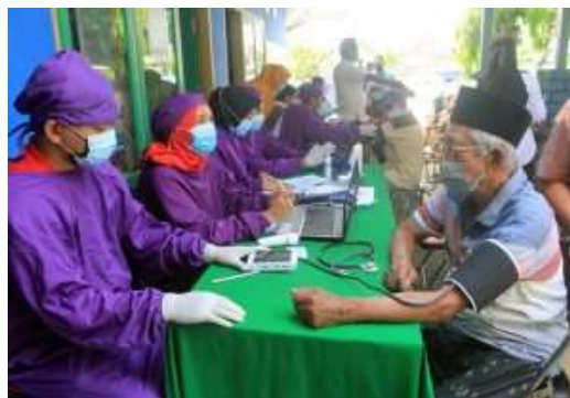
Figure 1.4 Elderly people had their blood pressure checked during a vaccination activity held by the Kraksaan Health Center