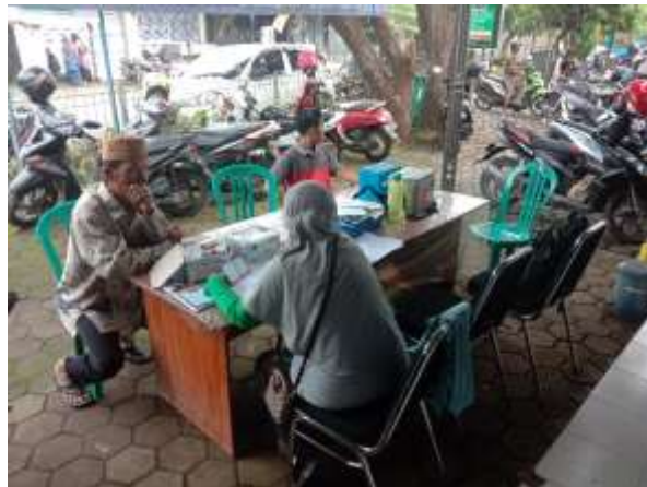
Figure 1.6 Vaccination Services at Besuk Health Center