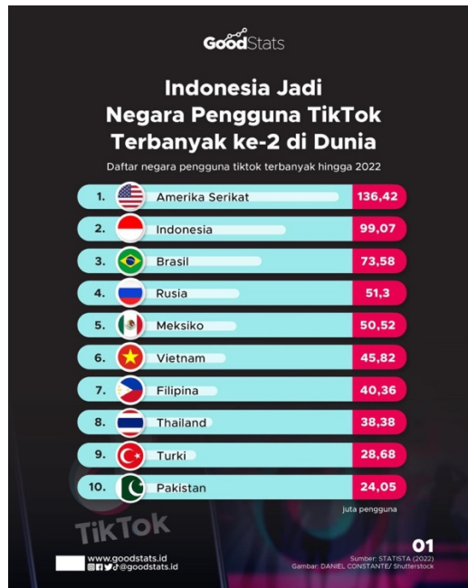
Image 1.2 Indonesia is the country with the 2 nd largest number of TikTok users in the world

TikTok is a social media platform that provides the possibility for its users to be able to make short videos with a duration of up to 3 minutes which are supported by music features, filters and various other creative features, and now TikTok has increasingly developed and can make videos up to 1 hour long. We can also use the live feature and various other features.