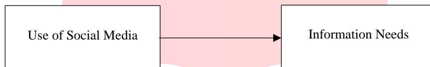
Figure 1. Research Framework Source Putri & Dimiyati, (2024)

In this research framework, there are two variables in it that influence each other. With the variables Use of Social Media and Information needs. Based on previous research, this research changes the object from Beauty Products for Generation Z in Bandung City to Telkom University Communications Science Students. So that the research framework is obtained as follows: