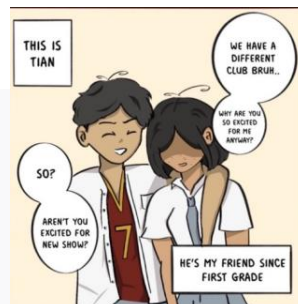
Picture 4.9 Panel Comic

In the fourth panel, Lily is depicted jumping in surprise due to Tian banging on the door and shouting her name as the bell rings. The authors designed Lily's shocked expression to reflect her reaction to the noise and Tian's call.