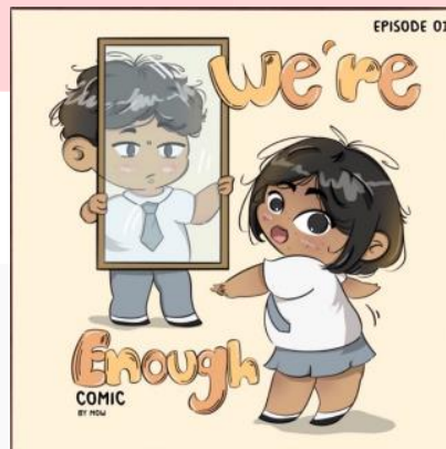
Picture 4.4 Design Cover