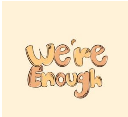
Picture 4.3 The Full Logo We're Enough Comic