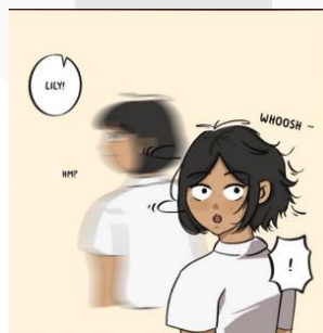
Picture 4.24 Panel Comic

The fourth panel depicts Lily's concerned expression as she continues to hope for the lead role in this week's show.