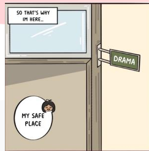
Picture 4.17 Panel Comic

The fourth panel illustrates Lily's dream of receiving an award for her acting skills, aspiring to achieve the recognition she admires in professional actors and actresses.