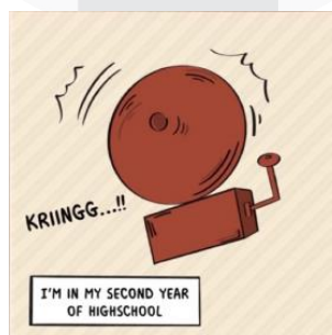
Picture 4.7 Panel Comic

In the second panel, Lily, the main character, makes her debut in a partially obscured manner, maintaining an element of mystery for the readers as her full face is not yet revealed.