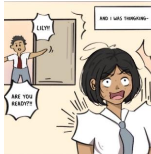
Picture 4.8 Panel Comic

The third panel continues with the school theme, similar to the first panel, and shows the school bell ringing to indicate that class has ended.