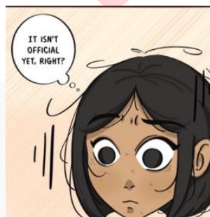
Picture 4.23 Panel Comic

The third panel introduces Kira, one of Lily's club friends, who often lands the lead roles in their shows due to her fitting visual appearance.