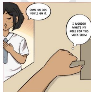
Picture 4.18 Panel Comic

The fifth panel shows the door to the club Lily has joined, which she refers to as her safe place.