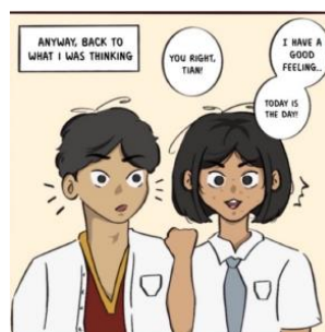
Picture 4.10 Panel Comic

In the fifth panel, Tian appears apologetic and amused, while Lily wonders why he is so enthusiastic about her. Despite her confusion, Tian remains cheerful and excited. This panel also presents Lily's perspective, introducing Tian as her friend.