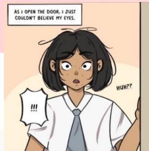
Picture 4.20 Panel Comic

The seventh panel captures the atmosphere inside the club as Lily opens the door, revealing the lively noise and activity from her club friends.