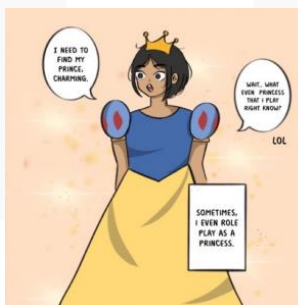
Picture 4.15 Panel Comic

The second panel shows young Lily enjoying imitating her favorite cartoon characters and pretending to be them as a child.