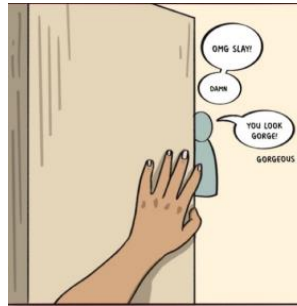
Picture 4.19 Panel Comic

The seventh panel captures the atmosphere inside the club as Lily opens the door, revealing the lively noise and activity from her club friends.