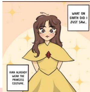
Picture 4.22 Panel Comic

The second panel reveals the reason behind Lily's shock from the previous episode, showing the noise and her friends' reactions to a girl in a pretty dress.