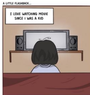
Picture 4.13 Panel Comic

The first panel depicts a flashback showing Lily's childhood passion for watching movies.