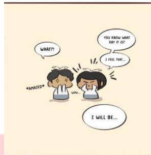
Picture 4.11 Panel Comic

In the sixth panel, Lily recalls the upcoming new show for her club this week, while Tian looks intrigued by her reaction to the announcement.