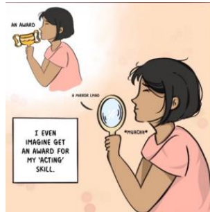
Picture 4.16 Panel Comic

The fourth panel illustrates Lily's dream of receiving an award for her acting skills, aspiring to achieve the recognition she admires in professional actors and actresses.