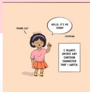
Picture 4.14 Panel Comic

The first panel depicts a flashback showing Lily's childhood passion for watching movies.