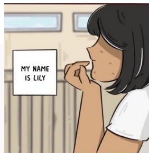
Picture 4.6 Panel Comic

The episode opens with a school setting in the first panel to establish the high school theme of the story for the readers.