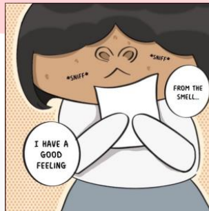
Picture 4.26 Panel Comic

The sixth panel depicts Lily's eyes lighting up as one of her friends hands her the role paper, indicating that she is about to discover her role for this week's show.