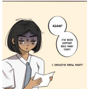
Picture 4.28 Panel Comic

The last panel of the episode shows Lily's disappointment as she reads the role she has been assigned.