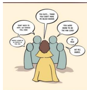
Picture 4.21 Panel Comic

The synopsis of the third episode describes Lily's excitement about potentially landing the lead role in this week's drama club show. The first panel provides a preview from the previous episode.