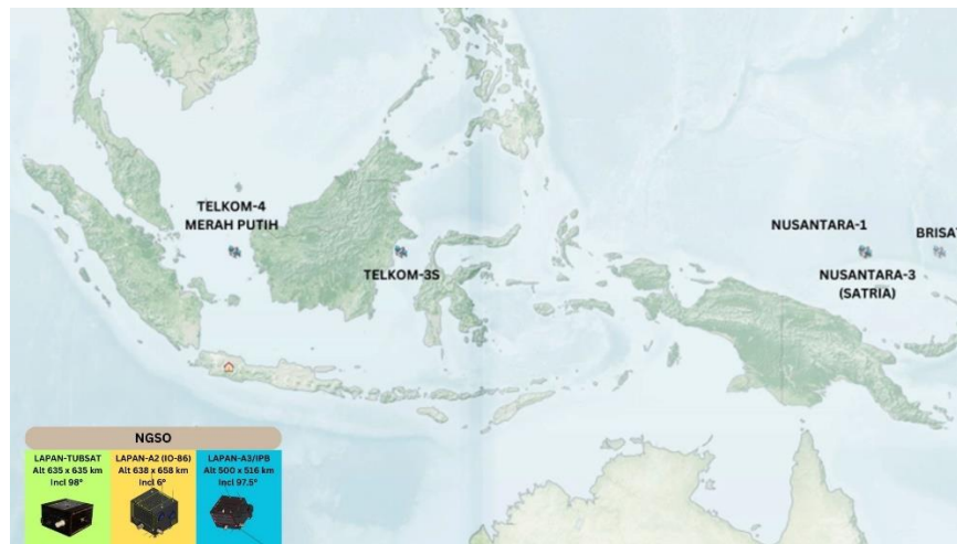
Figure 1.2 Indonesian Satellite Service Orbit Slots [13]

The use of GEO satellites is one of the solutions in integrating telecommunication networks in Indonesia, which can support backhaul networks for cellular or backend systems. However, GEO satellites have the disadvantage of high latency and delay due to the high orbit of the satellite. In addition to the technical issues of using GEO satellites for the backend, large antenna dimensions are required to obtain strong signal directional power to overcome significant propagation attenuation values.