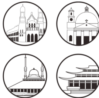
Figure 3: Four most recognized buildings identified by more than 75% respondents

The next step is redrawing the 10th most recognized building by its facade appearance as line-drawing colourless. The line-drawing pictures went to be second part testing form. Again, the same number of respondent taken randomly and showed the second part testing form. The result showed there are 4 building recognized by more than 75% respondents. They are, Lawang Sewu Building (97,47%), Provincial Great Mosque/ Masjid Agung Jawa Tengah (92,41%), Domed Church/ Gereja Blenduk (84,81%) and Sam Po Kong Temple (77,22%).