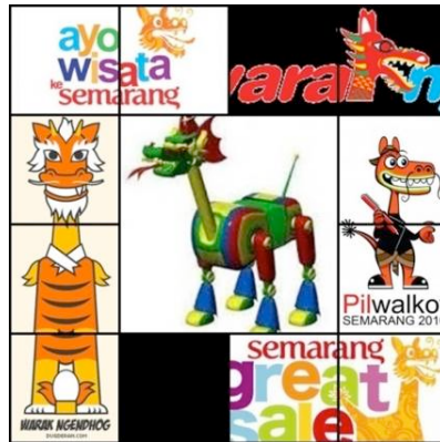
Figure 1: Various visual identity used Warak Ngendog as reference

In other side, Semarang has many heritage and valuable iconic buildings. Like other cities in the world, those buildings have exist for centuries, without affected by wars, revolution and major crisis (Halbwachs, 1950). This condition is indeed potential as a visual reference for the design of visual identity. The problem then is how to determine which the iconic buildings are common or well known by the people or the residents of the city of Semarang; in their natural appearance or when it was simplified by form. To answer this problems the simple random sampling poll have been conducted.